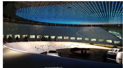
1. The Mercedes-Benz Museum