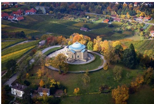
2. Würtemberg Mausoleum